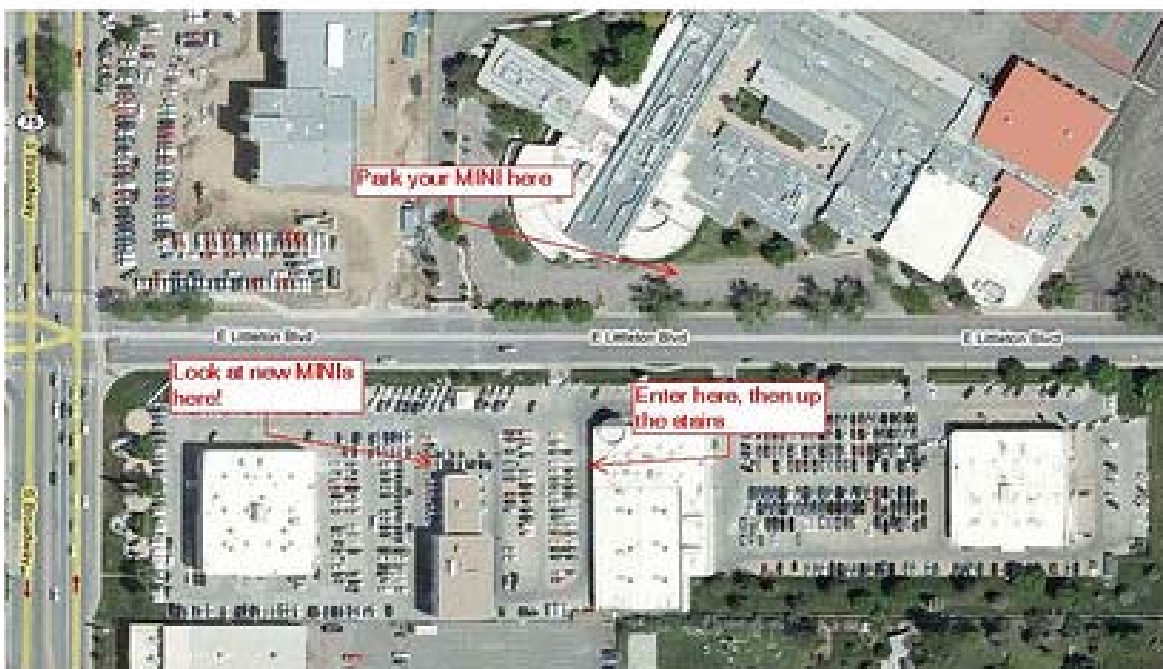
Ralph Schomp, 5700 S Broadway, Littleton, CO

Ralph Schomp is located at 5700 S Broadway in Littleton. We will hold the meeting upstairs in the Honda building. You can enter the Honda building on the west side doors and the stairs to the second floor will be to the right.